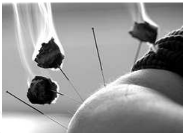
Fig. 6. A pattern of warming needle moxibustion

Yang (Zhang, 2008, as cited in Yang, 2002) used moxibustion with warming needle to treat 32 cases of simple obesity of deficiency type by selecting qi-hai, guan-yuan, zu-san-li, tian-shu, yin-ling-quan, and san-yin-jiao as the main points and secondary points according to differentiation of symptoms and signs. Following the arrival of qi, 1-2 lighted moxa sticks about 2 cm in length were consecutively put on the handles of the needles of the 2-3 main points, and the other needles were retained as usual. The treatment was given 6 times weekly, and 30 sessions constituted a therapeutic course. A total effective rate of 90.6% was achieved after one course of treatments.