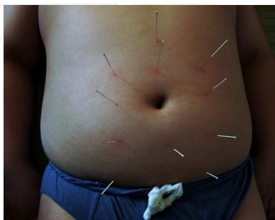
Fig. 2. Acupuncture being applied to the abdomen

Very basically, acupuncture is the insertion of stainless steel filiform needles into precisely specified acupoints on the body's surface, in order to influence physiological functioning of the body.