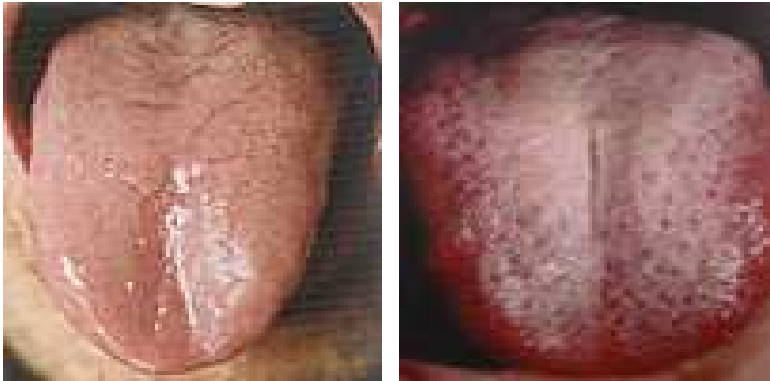
Fig. 1. Changes of tongue coating in different types of fat person(ICMHL, Shen-Nong Info.b)

Liver stagnation caused by prolonged strong emotions or depression leads to disharmony between the spleen and the liver and gives rise to fluid retention. Due to the liver being depressed, the gall bladder is also depressed and exhausted; the ebb and flow of these organs become unbalanced, and the qi mechanism does not flow freely. Hence fat turbidity is difficult to be transformed and over time it leads to obesity.