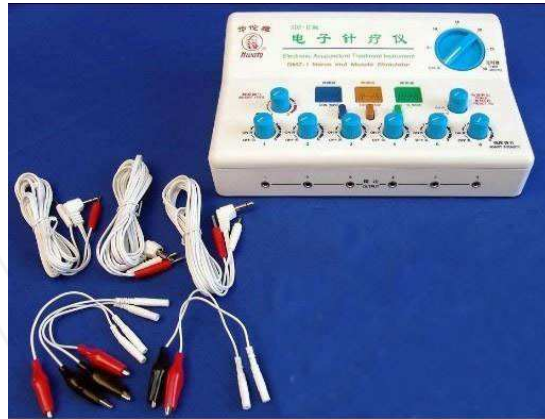
Fig. 5. An electric apparatus for electroacupuncture stimulation

libitum. A significant reduction of the body weight accompanied by a reduction in food intake was observed. 2 Hz EA was more effective than 100 Hz EA (Tian et al., 2005).